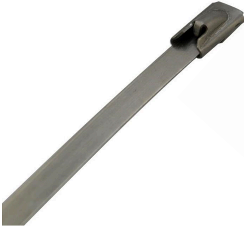
Stainless Steel Cable Ties