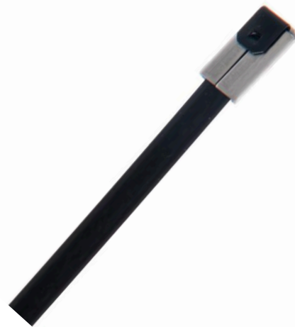
Coated Stainless Steel Cable Ties