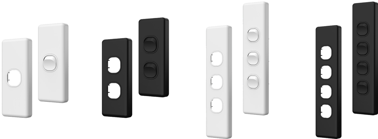
CSW1A, CSW1AP CSW2A, CSW2AP Matte White