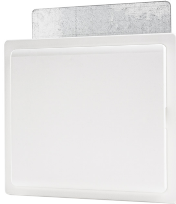
Front view installed