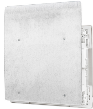
Back view installed